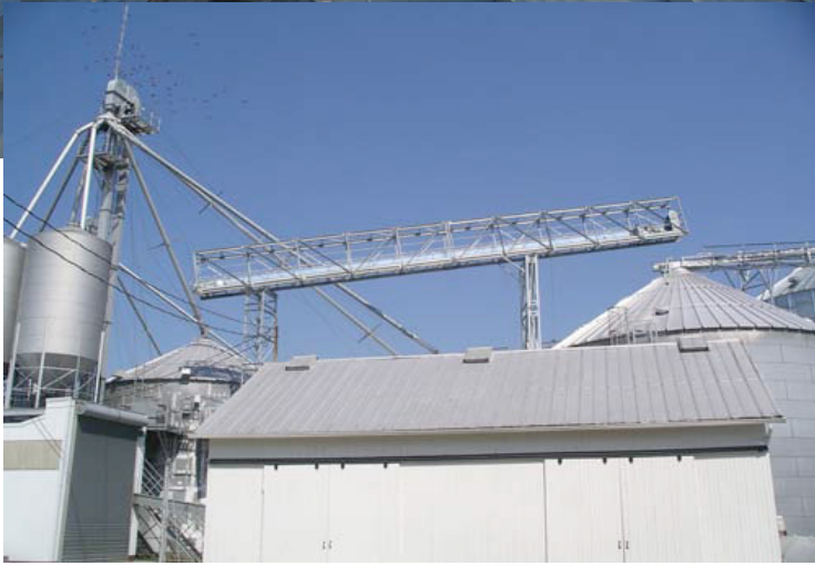
Cantilever Catwalks No Roof Loads