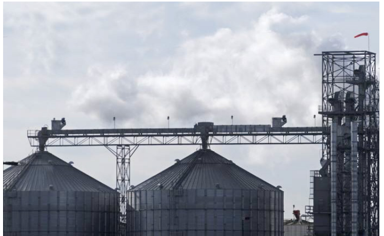
Under Bridge Catwalk