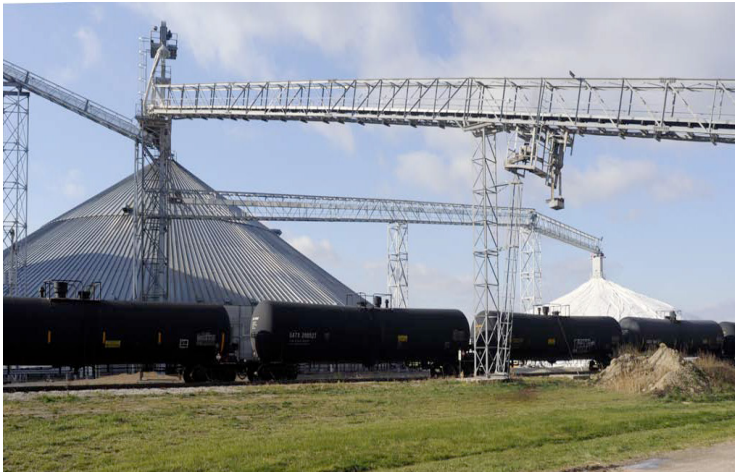
Most Efficient Walkthru Bridge Truss Catwalk