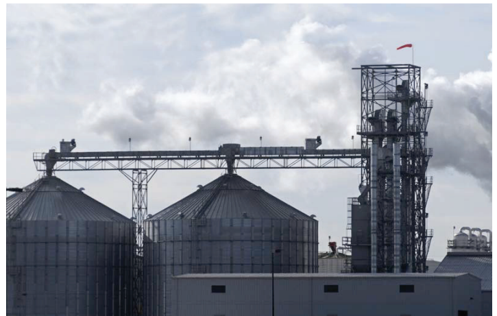
Under Bridge Catwalk