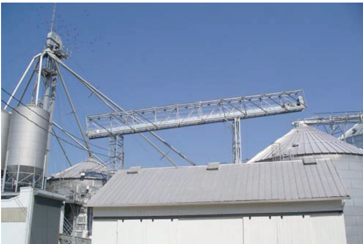
Cantilever Catwalks No Roof Loads