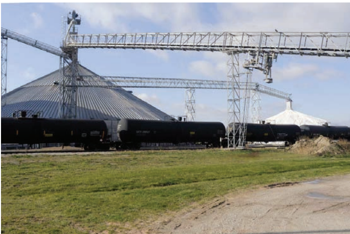
Most Efficient Walkthru Bridge Truss Catwalk